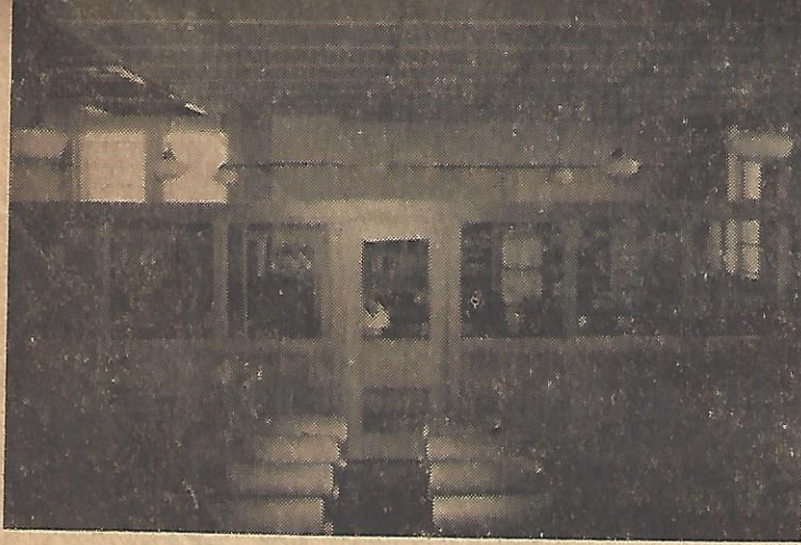
Entrance View from High School Assembly