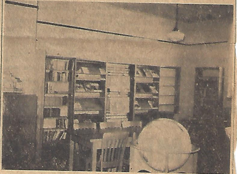
Northwest View of Library Interior