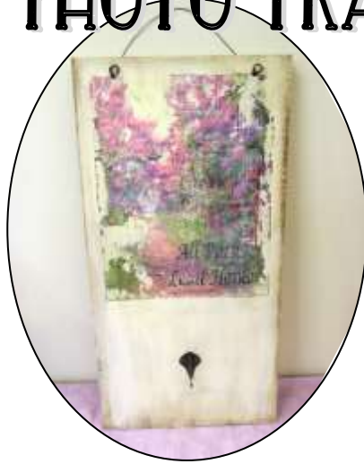
PHOTO TRANSFER ON WOOD

Take an image and transfer it to wood for a vintage look.