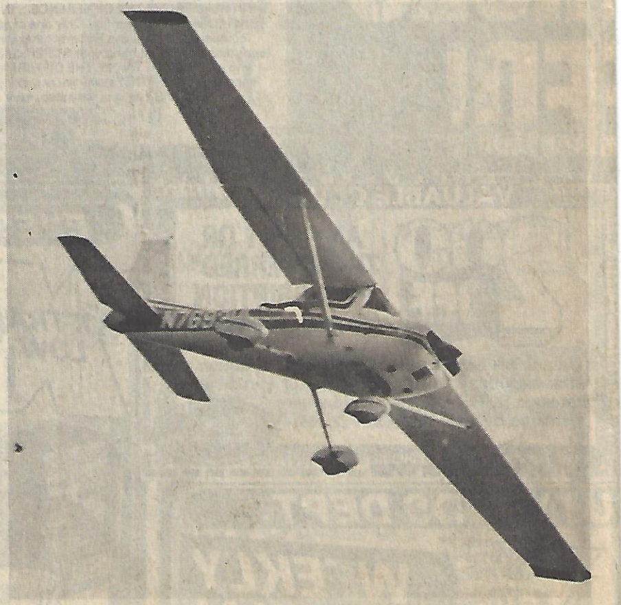
BOMBER — The dark spot in the lower left portion of the photograph above is a small sack of lime dropped from the plane above it during a "bombing contest" conducted by the

The rules and guidelines of the Rochester Flying Club were taken to Mentone by Crabill, pilot and flight instructor. The Rochester club disbanded a few years later