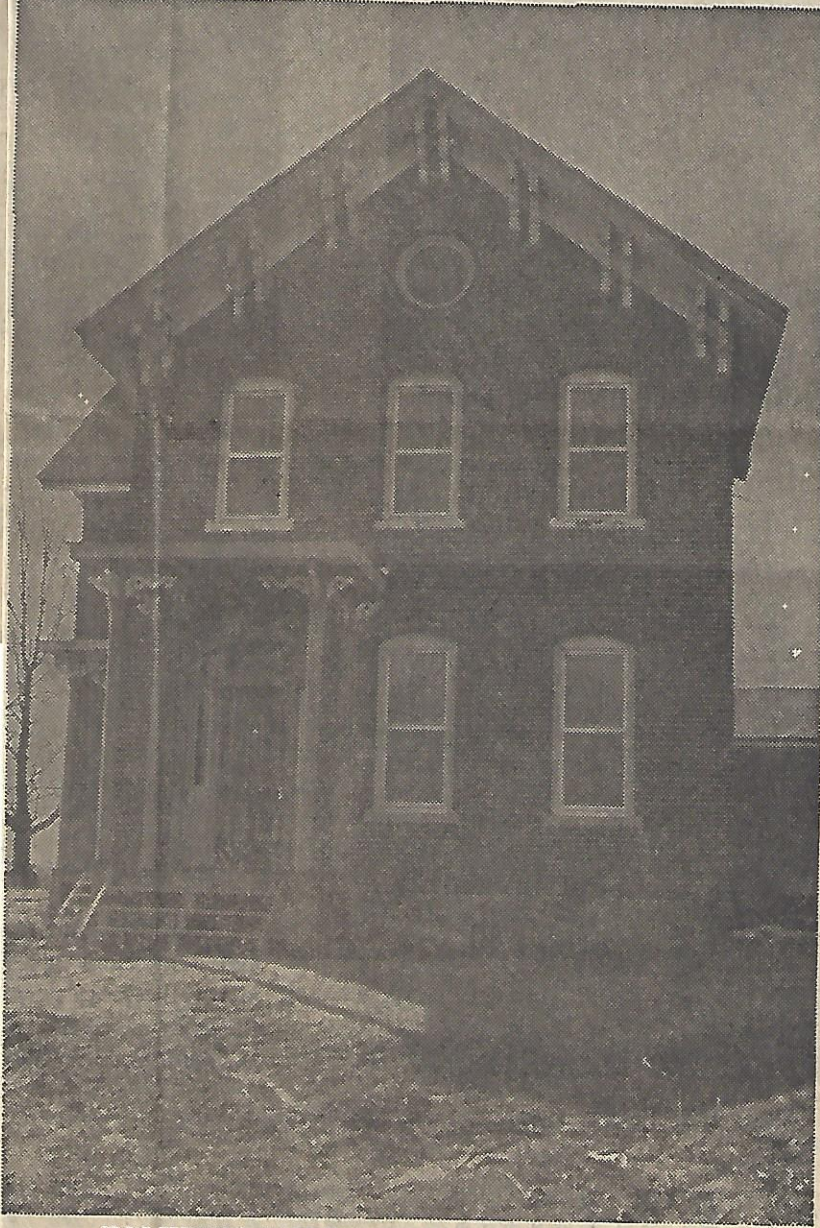
KOSCUISKO COUNTY HISTORICAL TOUR OCT. 2. Homes At Warsaw, Palestine, Mentone Included